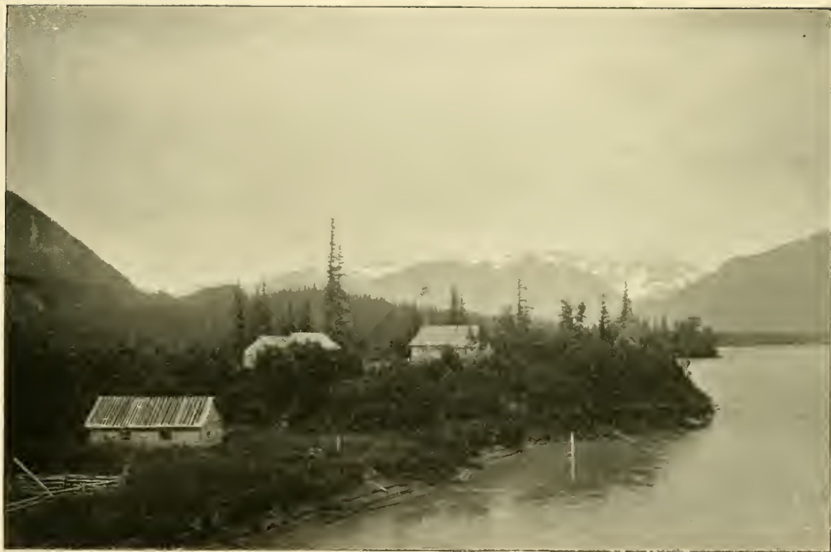
Disputed Boundary Line between United States and Canada on the Stickeen River.